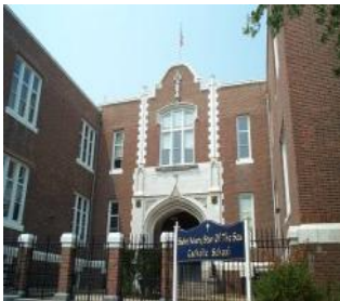
"Ave Maris Stella"