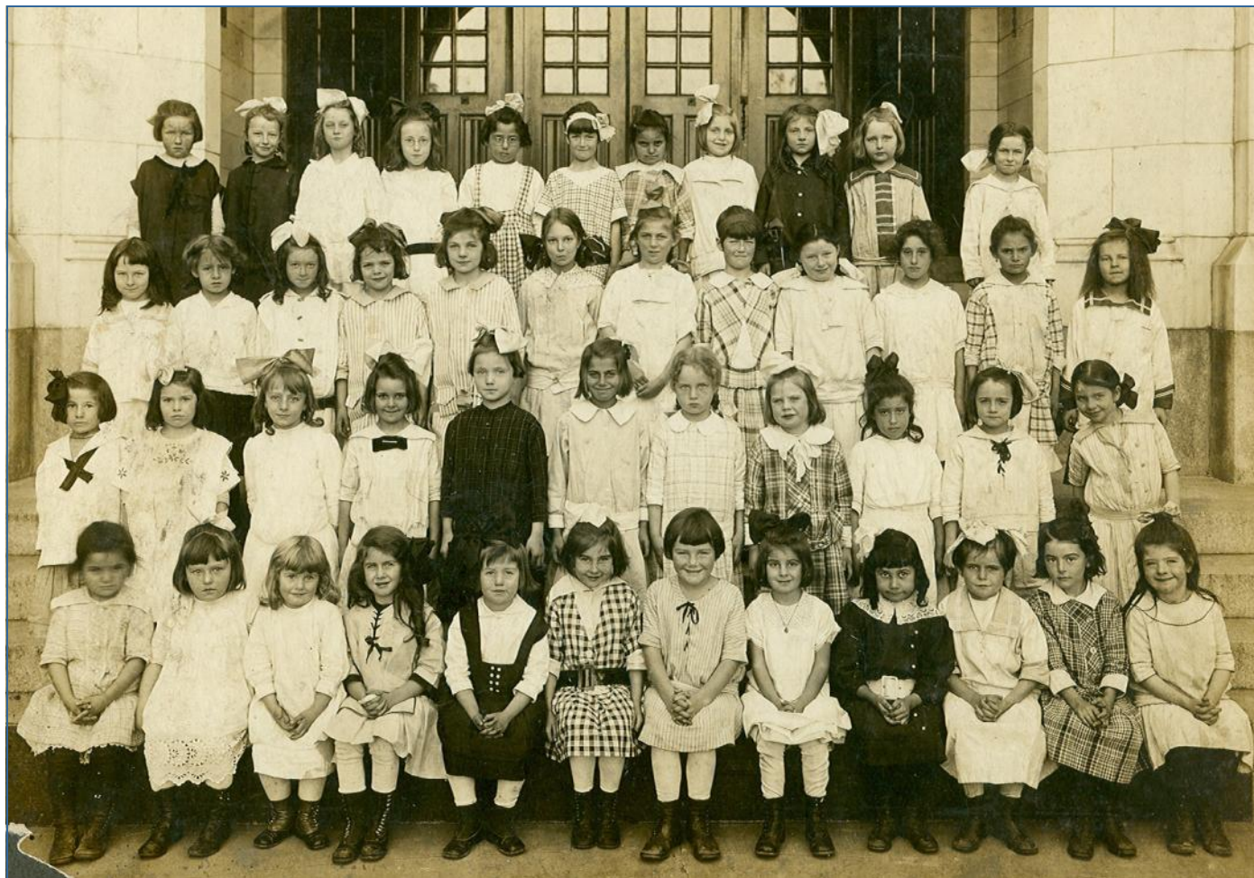
Grade 1-B, November 1915...recognize anyone?