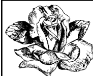
Día de las Madres