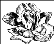
Día de las Madres