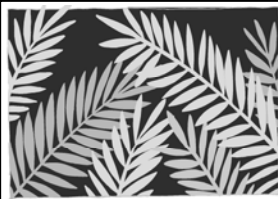
TRULY, THIS WAS THE SON OF GOD!