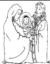
Nativity of the Blessed Virgin Mary

Monday, September 13 th – Pre-Kindergarten begins. All classes from Pre-K to Grade 8 8AM – 2PM