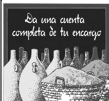
Da una cuenta completa de tu encargo

Si usted es nuevo en nuestra parroquia, puede hacerse miembro oficial de Santa María llenando una tarjeta de inscripción que está disponible en el vestíbulo de la Iglesia. ¡Que Dios les bendiga!