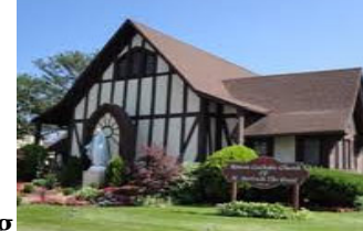
336 Beach 38th Street Far Rockaway, N.Y. 11691