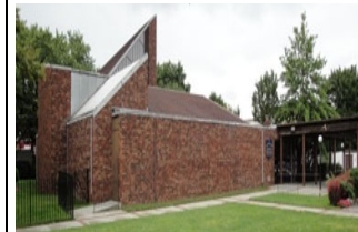
1920 New Haven Ave. Far Rockaway, N.Y. 11691